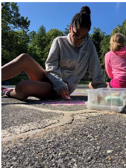
Arts and crafts can happen outside too!

In the afternoon we rotate through Arts and Crafts and Outdoor Activities. Usually the Outdoor Activity in the afternoon is a hike or creek activity so that we can be in the shade!