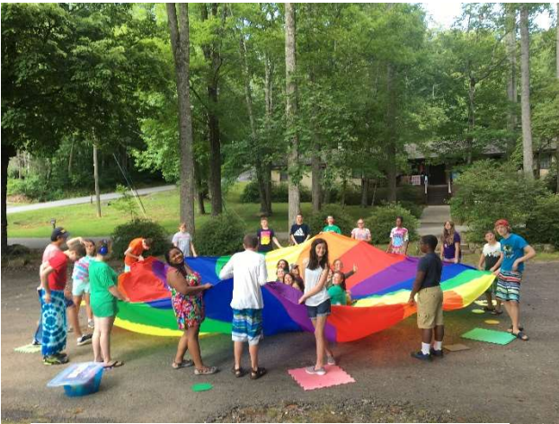
We usually start with parachute games.

Usually, the morning outdoor activity happens at our black top area. We normally start with a group activity, and then campers can go around and try different games with their counselor.