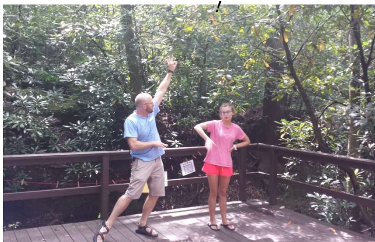
Sometimes, campers help lead songs.