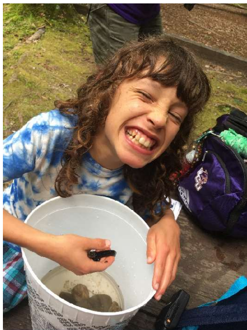
If you don't want to catch the critters yourself, you can check out what other folks have found.