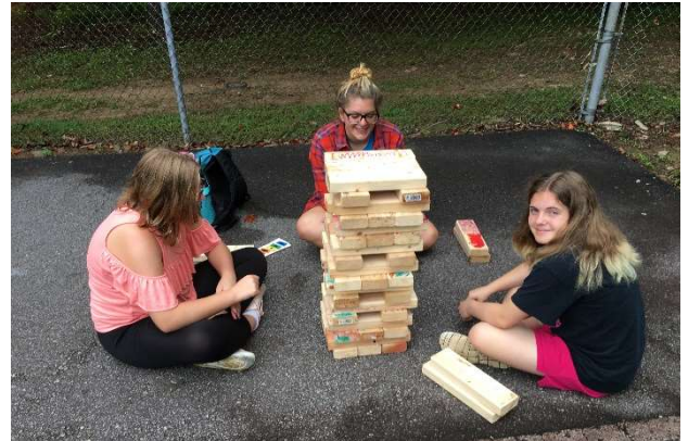
Giant Jenga is one of the games that could be set up for campers and counselors.

Putt-Putt Practice is another station you might see at outdoor activities.