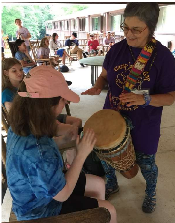
Sometimes, guest musicians come and share instruments with us.

After our 11:00 pool we go to lunch at the cafeteria, followed by an hour and a half rest time. Some campers sleep, some play games, and some watch a movie. There are at least 3 staff members in the cabin at nap, and the counselors have that time off. After rest, we head to the Shady Stage or the Rocking Chair Porch for Song Time!