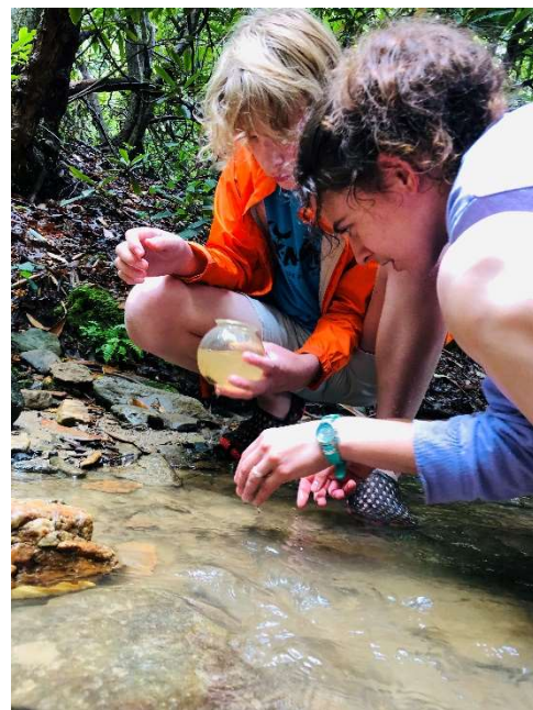
Our chilly mountain creek is a great place to look for critters!