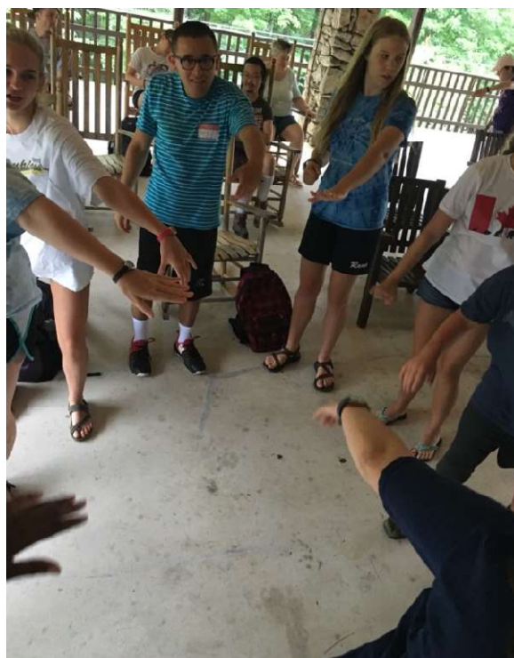
Counselors will help their campers learn the words and/or the motions for each song.