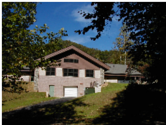
Outside of the cafeteria

After our 11:00 pool we go to lunch at the cafeteria, followed by an hour and a half rest time. Some campers sleep, some play games, and some watch a movie. There are 3 Activity Directors in the cabin at nap, and the counselors have that time off. After nap we head to the Shady Stage for Song Time!