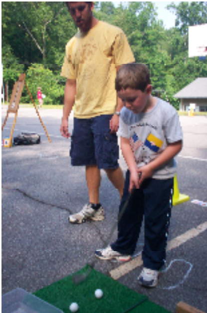
Putt-putt might be one of the activities to try with your counselor