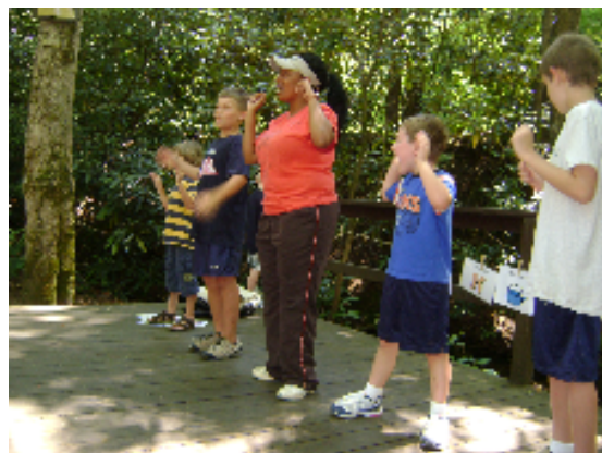
Singing silly camp songs is fun for most of our campers