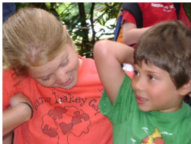
Counselors will help their campers learn the words and/or the motions so that they can enjoy song time their way!