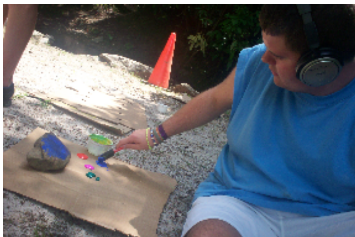
Arts and crafts can happen outside too!

In the afternoon we break the group into two small groups again. We rotate through Arts and Crafts and Outdoor Activities. Usually the Outdoor Activity in the afternoon is a hike or creek activity so that we can be in the shade!