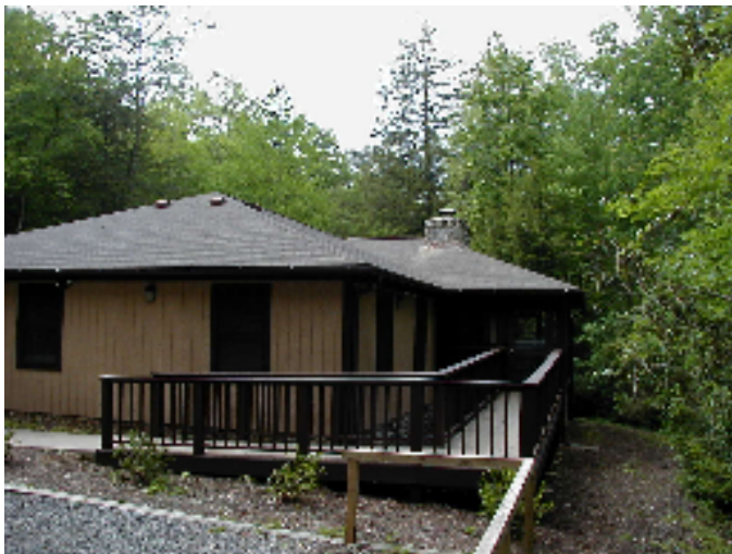
Outside of the Group Lodge