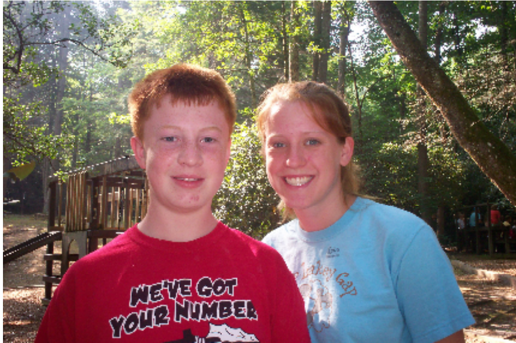
Beautiful wooded playground

Our play ground has rustic wooden play equipment, and is set in a wooded area with a creek running through it. We use the playground for specific activities, but mostly it is used for a place to go if your camper finishes an activity early or just has a few minutes before the next activity.