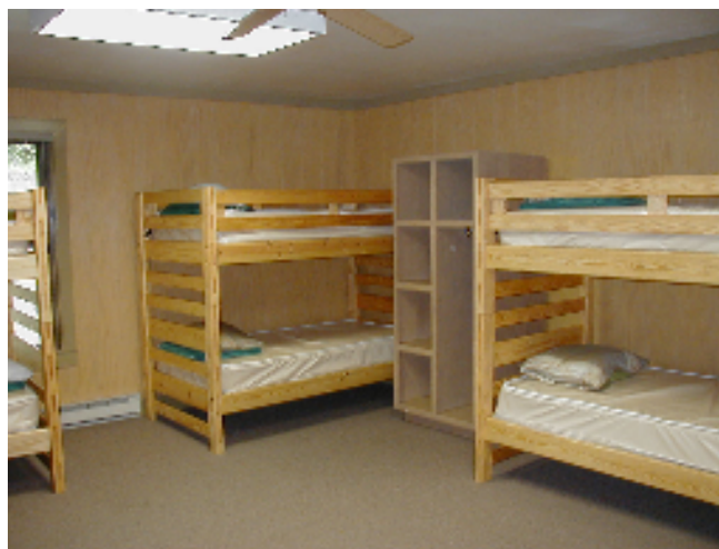
Inside one of the 4 bedrooms, 4-6campers to a room