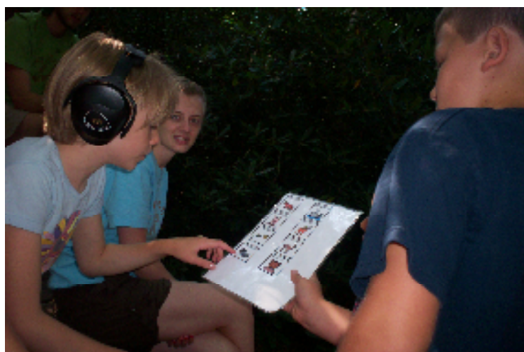
We utilize visual choice boards for some of our songs to make them more interactive