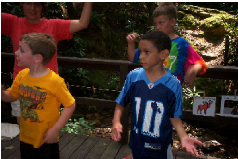
We love getting campers to help lead their favorite songs