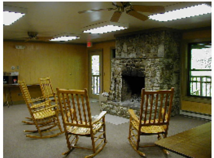
Inside common room of Group Lodge