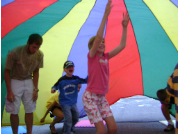
Parachute games are a great group activity to start with!

Usually the morning outdoor activity happens at our black top area. It will be set up so that first we start with a group activity, and then campers can go around and try different games with their counselor. We use a visually structured color matching system so that the campers get a chance to try each activity.