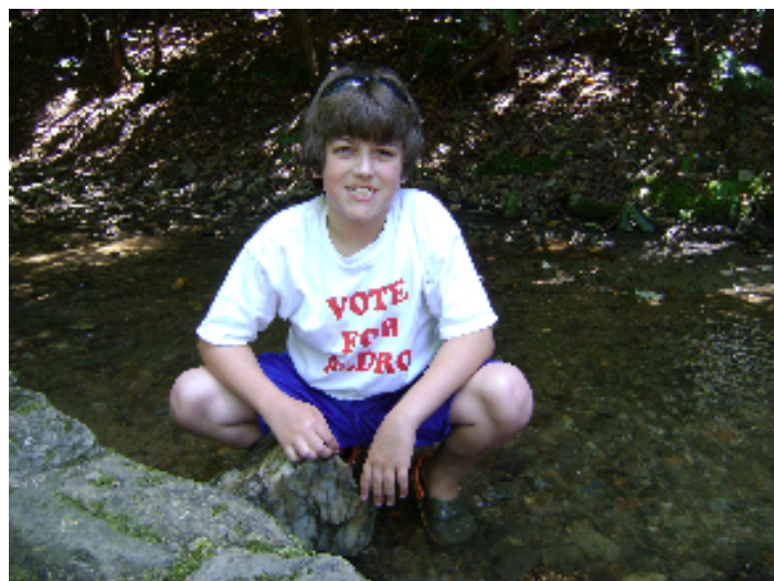
Our chilly mountain creek is a great place to look for critters!